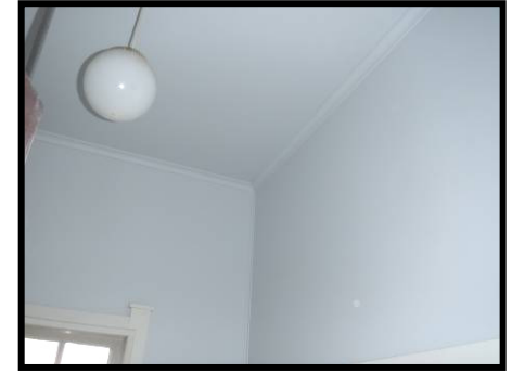
4. First bathroom