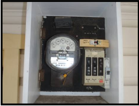
1. Mounting board