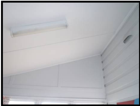
5. Locker area