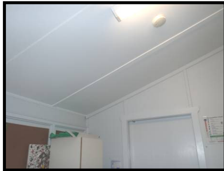
6. Change room