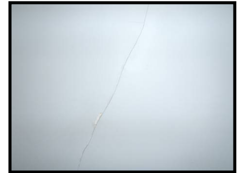
8. Broken sheet